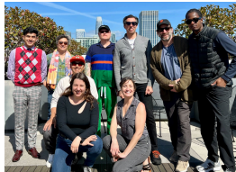
SWNA Board of Directors

We are just finalizing the last details of our Partner Program; a way for us and our neighborhood businesses to support each other as we enjoy our time in SOMA. If you'd like your business to be a member, let us know!